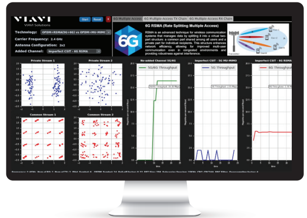
Rate Splitting Multiple Access (RSMA)

OTFS is a cutting-edge modulation technique tailored for highly dispersive wireless channels. Unlike traditional modulation schemes that function in the time-frequency domain, OTFS operates in the delay-Doppler domain. In this two-dimensional space, one axis represents the delays from multipath components, while the other denotes the Doppler shifts due to relative motion between transmitters and receivers. By mapping symbols in this domain, OTFS effectively harnesses the channel's diversity in both delay and Doppler, offering enhanced resilience to channel impairments and rapid variations. This makes it particularly suitable for high-mobility scenarios, including vehicular communications, high-speed trains, and satellite transmissions.