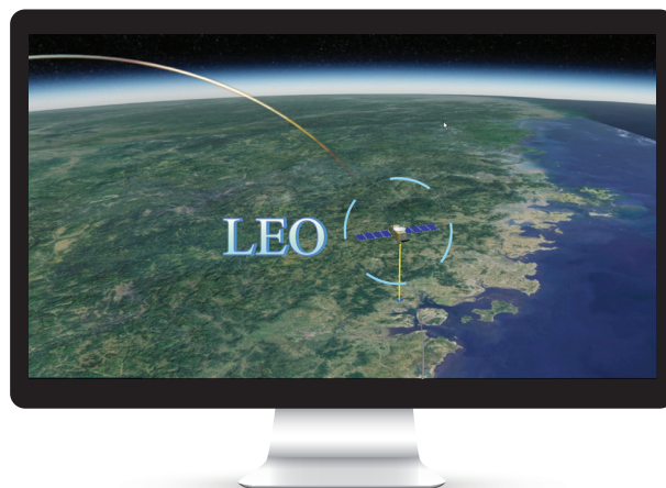
6G 3D Mobility Management Capture